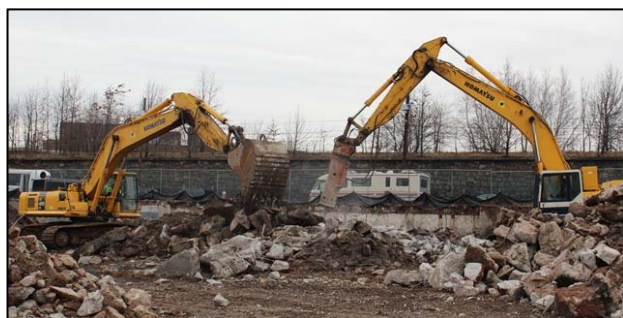
Phase 1 Work at ES #3 site

To avoid the mistakes of the past, the SDA changed the way that it advances construction contracts for Capital Projects. A concern frequently encountered in years past was the prevalence of change order submissions due to issues encountered on project sites. This generally occurred because a contractor would receive a construction award to begin demolition and site preparation activities and only thereafter identify significant issues that impacted both schedule and cost. One way the SDA is working to avoid this issue is by separating site packages and building construction into two phases. Now, SDA procures a contract to do Phase 1 site construction activities which can include demolition, site remediation, removal of underground storage tanks and more. At the end of this phase of work, the project site is ready for the building of a school. By separating the construction activities into two procurements, the SDA has experienced fewer change orders and schedule delays.