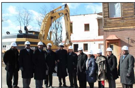
Officials Tour Phase 1 Activities at PS 16 Site

Also that month, SDA and Paterson Public Schools officials joined local legislators and city officials to tour the Phase 1 activities at the new PS 16 construction site. This work includes demolition of 26 commercial/residential buildings on the three acre site, removal of any hazardous material, removal of underground and above ground storage tanks, site demolition and controlled backfill to prepare the site for future construction.