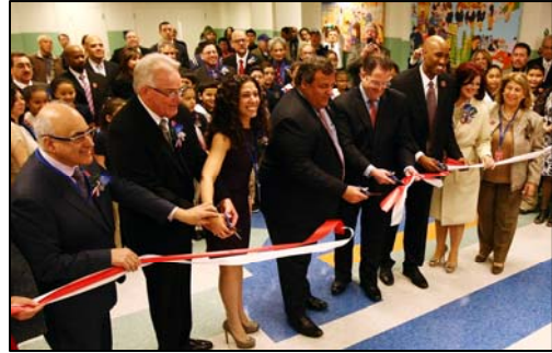
Ribbon Cutting for Colin Powell E.S.

Governor Christie acknowledged that the opening of this new facility exemplifies the positive outcomes that can occur through a collaborative partnership among state and local officials. After overcoming challenges associated with early site work on this project, the school opened to 700 students in grades kindergarten through fifth this past September.