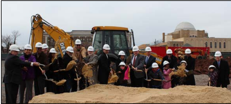
Groundbreaking for new A. Chester Redshaw E.S. in New Brunswick