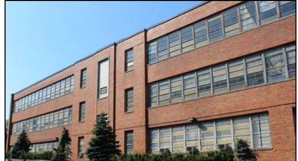
Former Parochial High School Purchased in West New York

Through the pursuit and use of alternative delivery methods, the SDA was able to address the Memorial High School project from the 2012 Capital Portfolio during this reporting period. The success of this project speaks to the effectiveness of the SDA's ongoing working group efforts. During working group meetings involving the SDA,