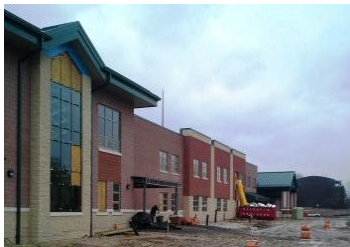
Catrambone Elementary School - Long Branch