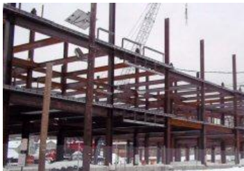
Henry Street Elementary School - Passaic City