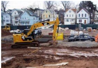
Elliott Street Elementary School - Newark