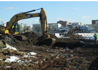
Oliver Street Elementary School - Newark