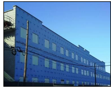
Construction progress of Redshaw Elementary School in New Brunswick during the reporting period.

This reporting period is highlighted by a substantial amount of activity on the SDA's Capital Portfolio Projects. In fact, more than half of the 39 projects in the portfolio were in construction/design by the end of the reporting period, including nine schools currently in active construction. These nine schools will provide 8,300 new seats for students in eight school districts. These projects represent more than $561.5 million in total estimated project costs and make available vital opportunities for New Jersey's construction industry.