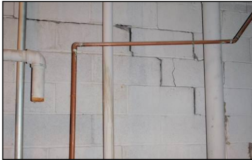
Cracked loadbearing wall that was fixed through an emergent project

Often, emergent projects require significant design work, due to the need for asbestos abatement or other considerations. This sometimes requires that a project have predesign services. Predesign allows for the design consultant to identify the true source of the conditions. A problem may be identifiable by sight, but a determination must still be made as to what is causing the problem so that the remedy selected is the correct one. This work also allows for the identification of any hazards that may impact the work.