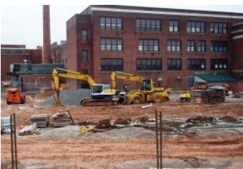
Academic High School - Elizabeth

Since a picture is worth a thousand words, the SDA has striven to keep community members updated on project progress through the posting of monthly progress photos for active construction projects. Progress photos can be accessed on the SDA's website at: http://www.njsda.gov/Schools/Project_Progress_Photos.html . Below is a sampling of progress photos from the reporting period.