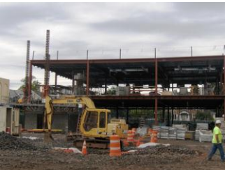
Redshaw Elementary School - New Brunswick