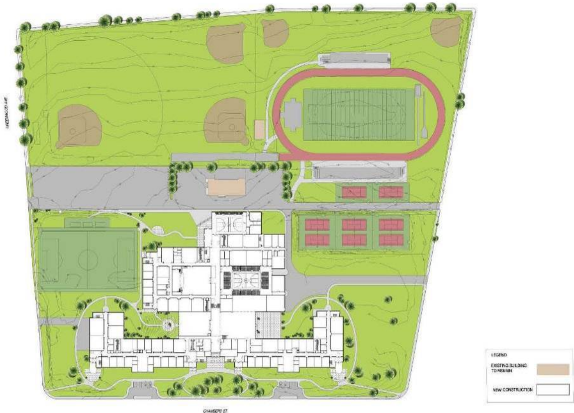
Site plan for the new Trenton Central High School

The SDA will move forward with plans for a new school utilizing a design-build approach. In order to prepare the school site for the construction a new building, the SDA anticipates demolition activities will begin in the spring of 2015.