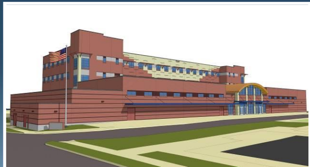
Garfield James Madison Elementary School