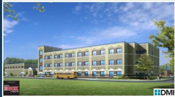
Elizabeth New Elementary School