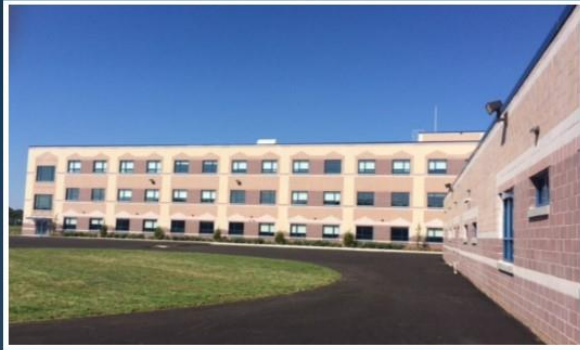
Bridgeton Quarter Mile Lane Elementary School