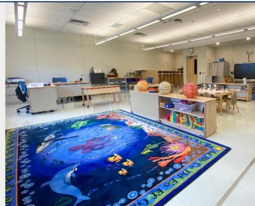
PORT MONMOUTH ROAD SCHOOL, KEANSBURG